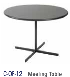
42" round, black top