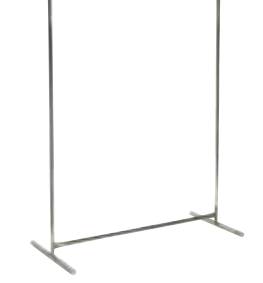
114 Garment Rack, stationary