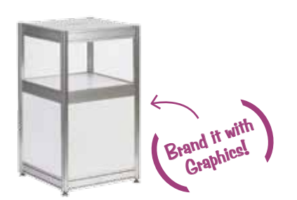
501 Acrylic Ballot Box 21" square x 36" H