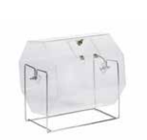
303 Draw Drum, clear acrylic