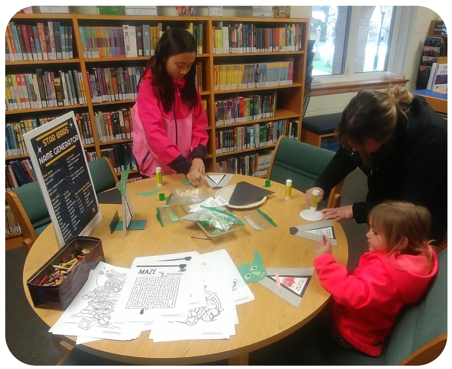
Make & Take Crafts at the Schomberg Branch for May the Fourth (Star Wars Day) in 2019.