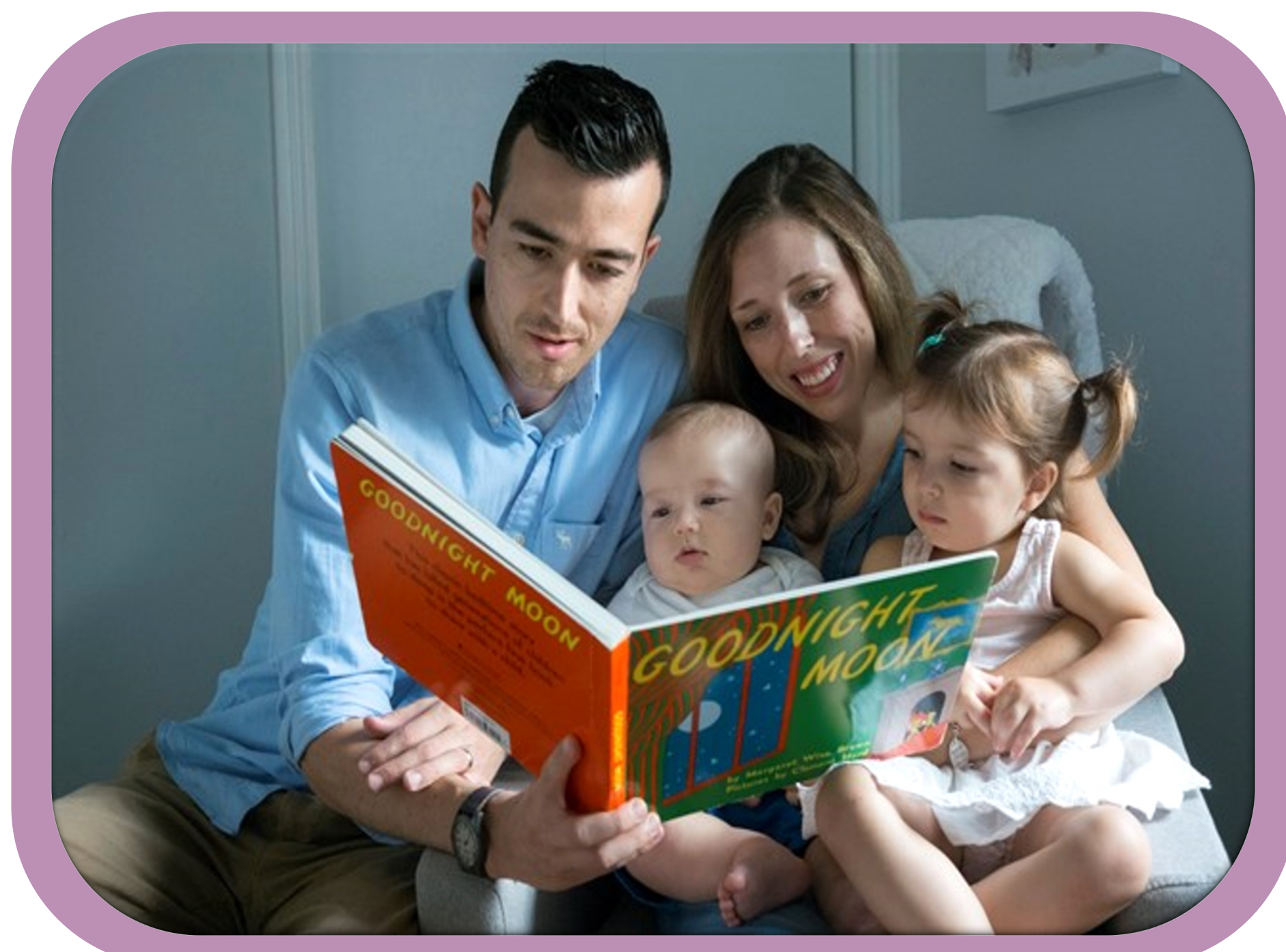
Early Literacy Program Statistics