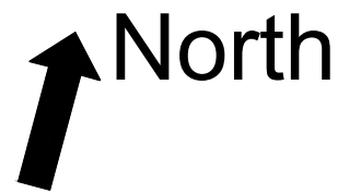
EXHIBIT HALL "C"